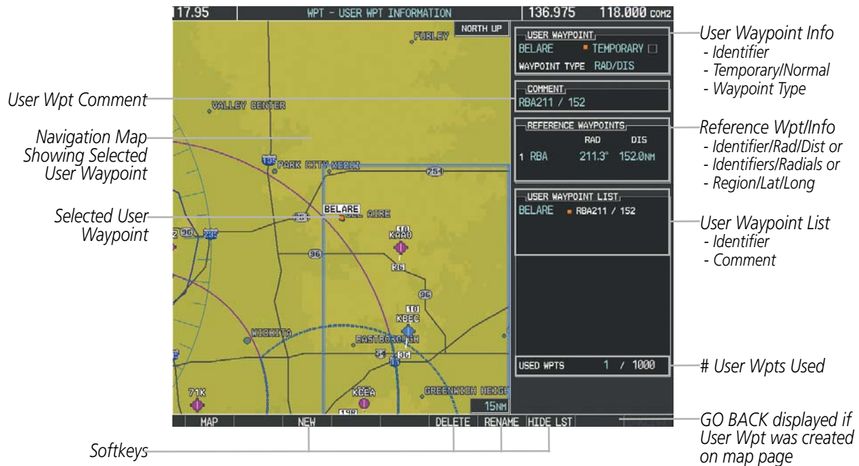
Figure 5-45 User Waypoint Information Page

The G1000 can create and store up to 1,000 user-defined waypoints. User waypoints can be created from any map page (except PFD Inset Map, AUX-Trip Planning Page, or Procedure Pages) by selecting a position on the map using the Joystick , or from the User Waypoint Information Page by referencing a bearing/distance from an existing waypoint, bearings from two existing waypoints, or latitude and longitude. Once a waypoint has been created, it can be renamed, deleted, or moved. Temporary user waypoints are erased upon system power down.