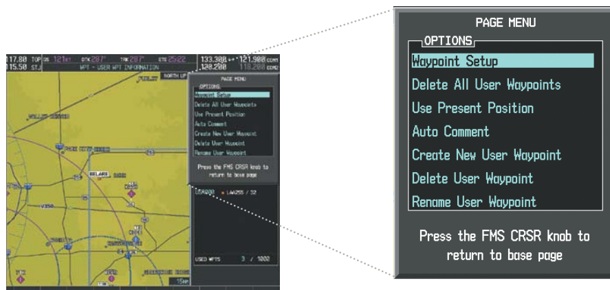
Figure 5-47 User Waypoint Information Page Menu